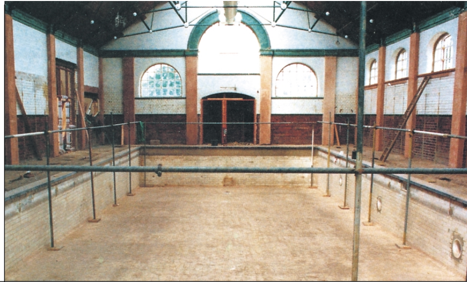
Alkorplan is the perfect way to renovate old leaking tiles or