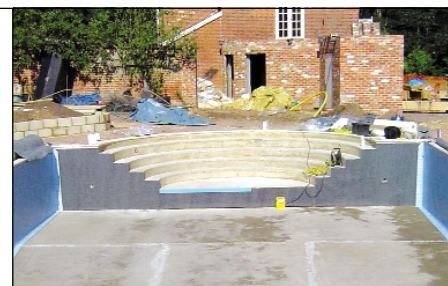
Complex shapes can be accommodated