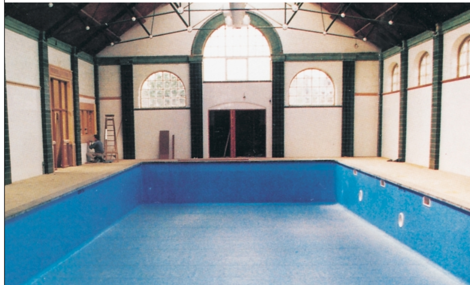
New liner guaranteed for 10 years. The perfect finish with ultimate protection

Ideal for... Schools, Hotels, Holiday Parks, Health Clubs, Deck level Pools, Hydrotherapy Pools