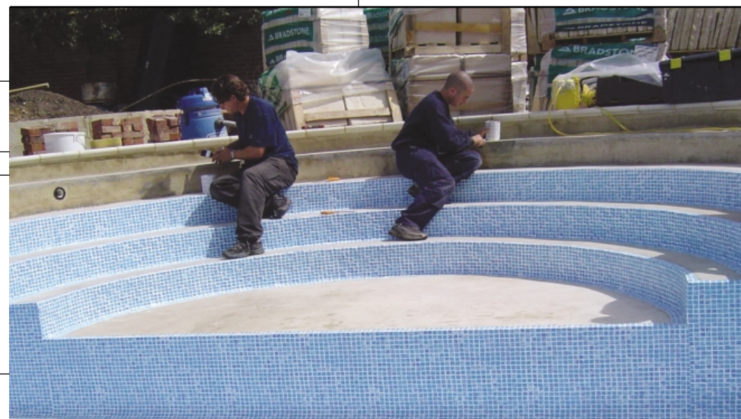
Steps easily transformed