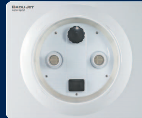
BADU Jet super-sport

Experience a new quality of freedom in your own pool. Create a small holiday paradise right there in your garden and enjoy the possibilities for both fitness and relaxation.