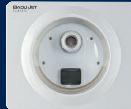
BADU Jet CLASSIC

Everything a pool needs. Expand the possibilities for keeping fit or diving into a wide sea of relaxation. At any time, whenever you feel like it. No more stressful long journeys to reach the closest beach. Your own pool is now a holiday paradise!