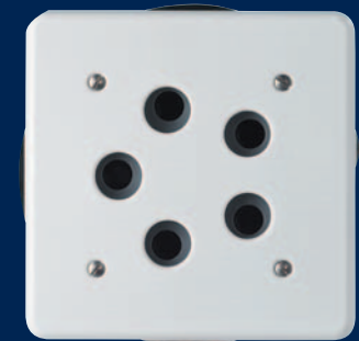
BADU Massage stations