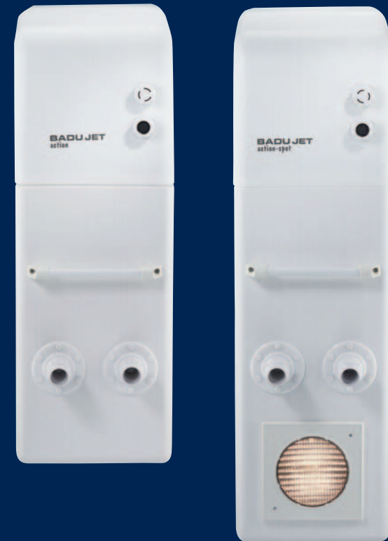
BADU Jet action

In order that you can keep fit when it's late as well, this power pack also comes with a powerful 300 W underwater spotlight, which also bathes your pool in a wonderful, atmospheric light.