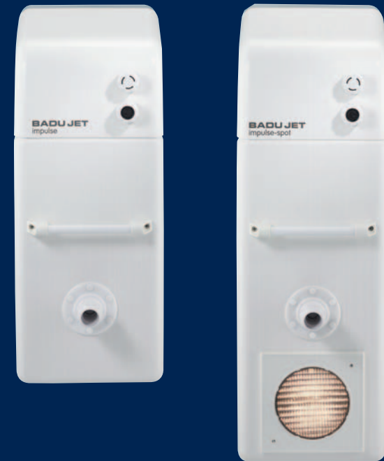
BADU Jet impulse

The BADU Jet impulse is of course also available with an underwater spotlight. For a restful, and perhaps sensuous, evening in the glow of your brightly lit pool.