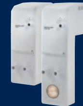
BADU Jet action