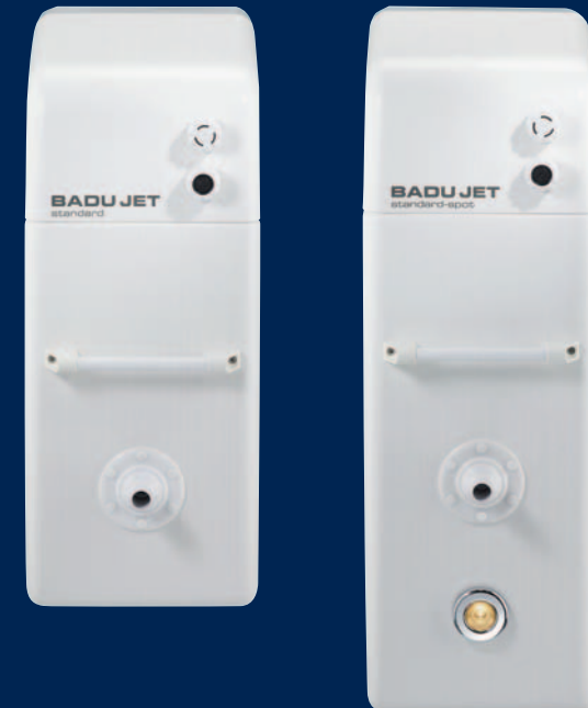
BADU Jet standard

A romantic mood is created by the version with built-in underwater spotlight – the BADU Jet standard-spot. In the evening hours, a powerful 50 W spotlight bathes your pool in a soft, tranquil light, which invites you irresistibly to relax.