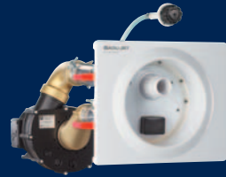
BADU Jet classic