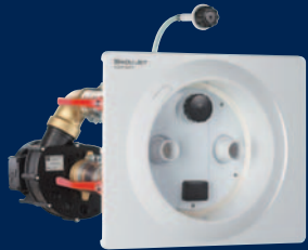
BADU Jet super-sport