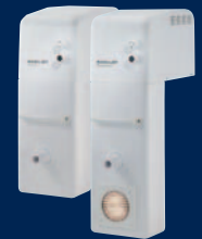
BADU Jet swing