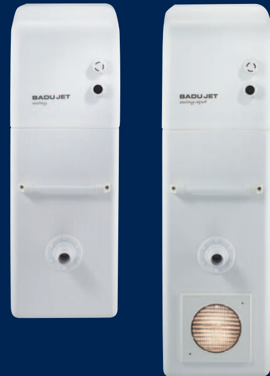
BADU Jet swing

For an atmospheric evening around or in the pool, a version of this model with a 300 W underwater spotlight is also available. Enjoy the sight of your pool bathed in light and the envious looks of your friends and neighbours.