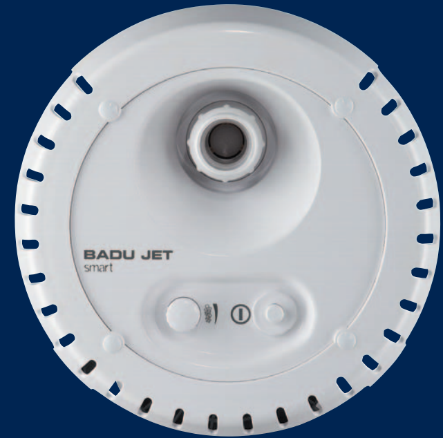
BADU Jet smart

Its compact form makes it suitable for virtually any pool. Very simple installation and low maintenance costs add to the fun factor of this system.