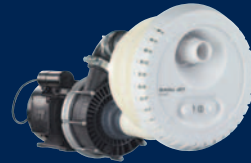
BADU Jet smart